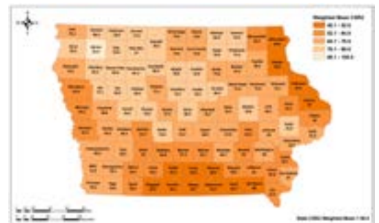
Calculated from NRCS acreages and CSR2 values contained in ISPAID (Iowa Soil Properties and Interpretations Database) version 8.1 as of May 2017.

12119 Stratford Drive, Suite B Clive, IA 50325