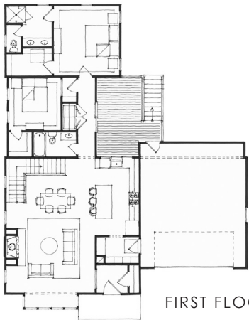
The Parkland Floor Plan

Modern farmhouse cottage featuring simple lines with board and batten siding. Front yard terrace and outdoor living area. Window bay featuring modern styled windows. Open floor plan concept with 10' ceilings and gas fireplace. Private primary bedroom suite on the main level. Other features: zero entry, convenient laundry location next to bedrooms, rear entertaining deck with access just off of kitchen and dining area, unfinished lower level can be finished with 2 more bedrooms if needed. Walk to town farm, vegetable stand, farmers market events, Middlebrook Mercantile (wine and provisions), and other community amenities in this amazing development! DUES: $80 a month cover snow removal and lawn care (plus $650 annual GWC dues).