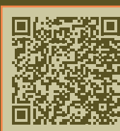
SCAN THE QR CODE to view Listing #16252 on PeoplesCompany.com.