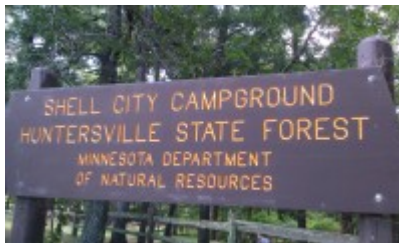
Shell City Campground (10/20/2011)

https://webapps17.dnr.state.mn.us/photoUpload/photos/slides/photo1320643939914.jpg