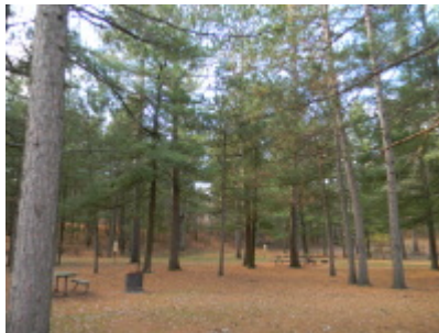
Huntersville State Forest Campground (10/20/2011) - Beau Lofgren

https://webapps17.dnr.state.mn.us/photoUpload/photos/slides/photo1320640688743.jpg