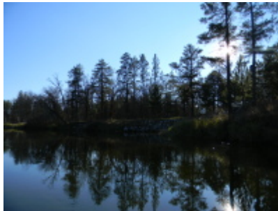
Shell City Campground - Looking West Up the Shell River (10/20/2011) - Beau Lofgren

https://webapps17.dnr.state.mn.us/photoUpload/photos/slides/photo1320643146602.jpg