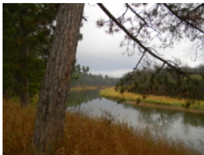
Dusk (09/21/2019) - Mark

. (https://webapps17.dnr.state.mn.us/photoUpload/photos/slides/photo1320642809951.jpg)